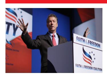
The new era of conservative It's time to kill the word